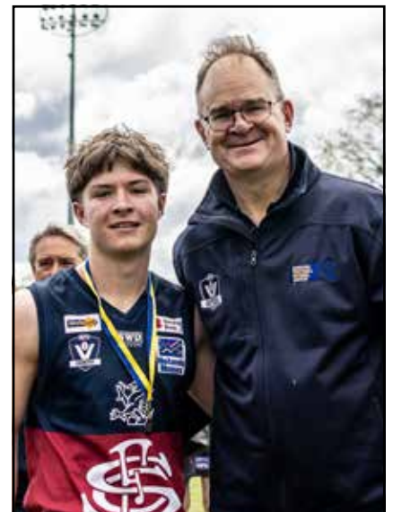
2024 ASHMAN MEDALLIST