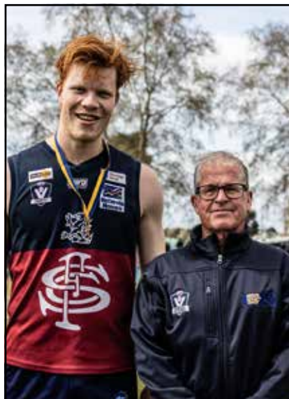
2024 TURNER MEDALLIST