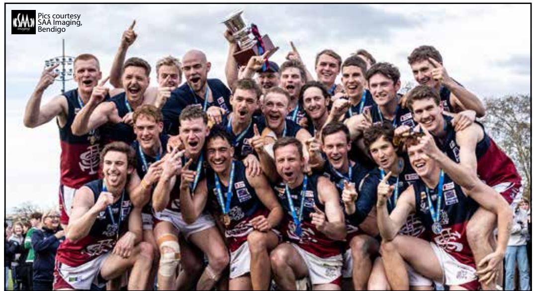
Senior Football Premiers Sandhurst FNC and A Grade Netball Premiers Gisborne FNC