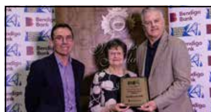
DAVID McCANN MEMORIAL CUP 2024 CHAMPION CLUB AWARD